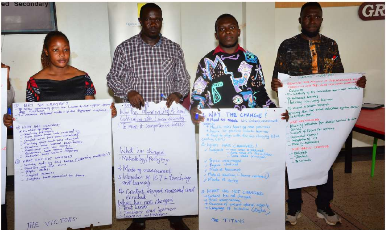
Teaching staff presenting and brainstorming ideas during the 3days NCDC training held at the Viva main campus-Jinja

From 26th to 28th of January, 2026, members of the teaching staff participated in a three-day professional workshop facilitated by the National Curriculum Development Centre (NCDC) and the Uganda Revenue Authority (URA). The workshop focused on deepening understanding