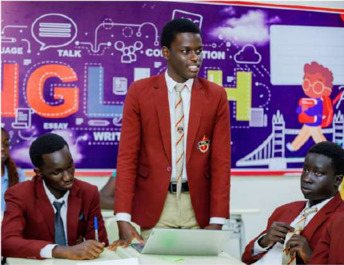
Students to represent Viva College in the Science Olympiads