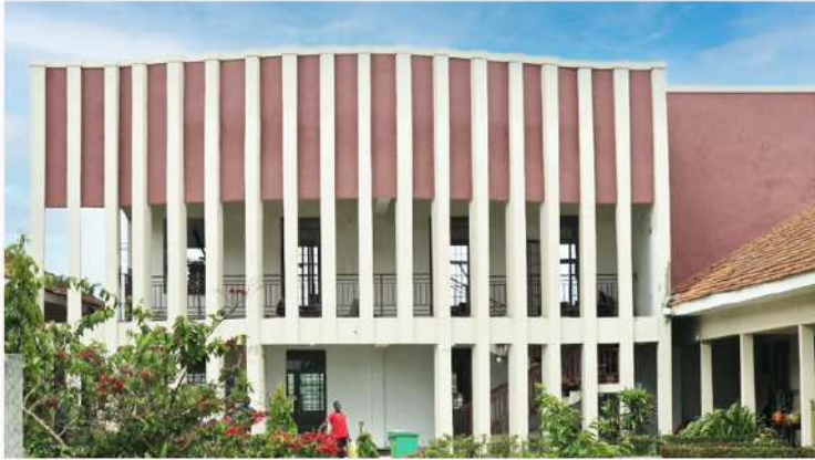
The new 100 seater modern computer laboratory building